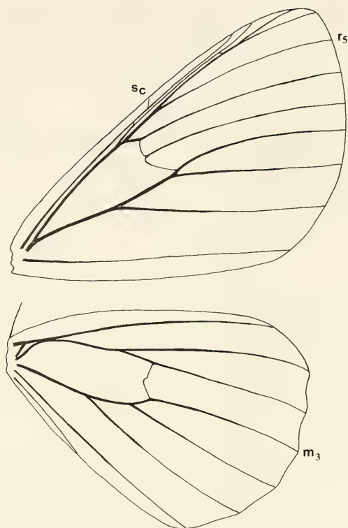
Fig. 1. Venation of Inouea cyclobalia West.